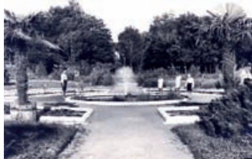
Fountain and ponds with water lilies, 1924