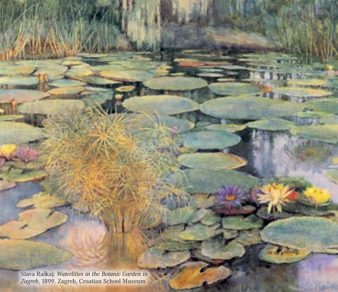
Slava Raškaj: Waterlilies in the Botanic Garden in Zagreb , 1899. Zagreb, Croatian School Museum