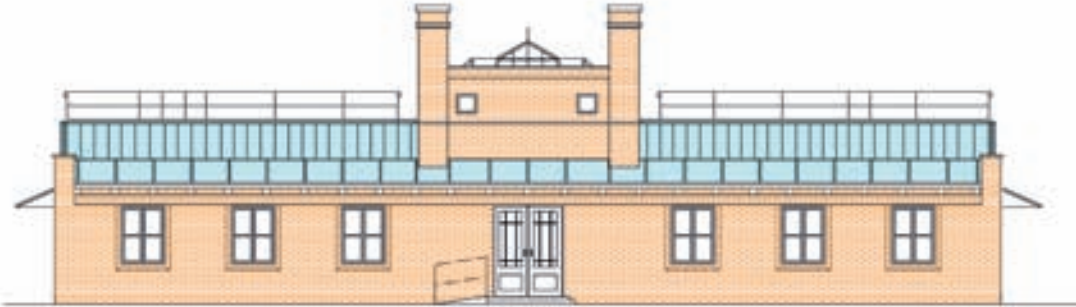
Exhibition greenhouses restoration project - the facades. Author: conservation architect Mladen Perušić, 2013