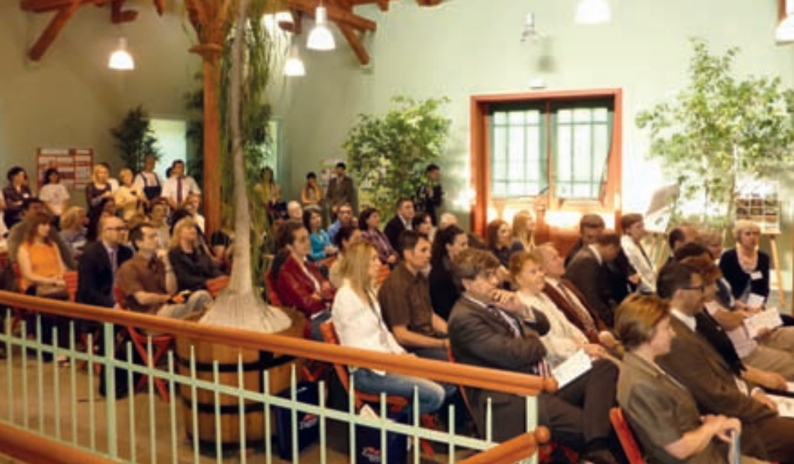
1 st Week of Croatian Botanical Gardens and Arboreta opening ceremony in the Garden's exhibition pavilion