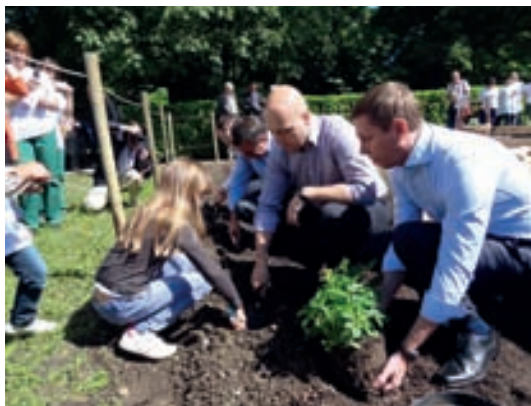
Little hands and big hands sowing and planting in the new children's flower and vegetable garden , 2013