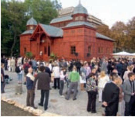
Annual University garden party held near the Garden's exhibition pavilion , 2011