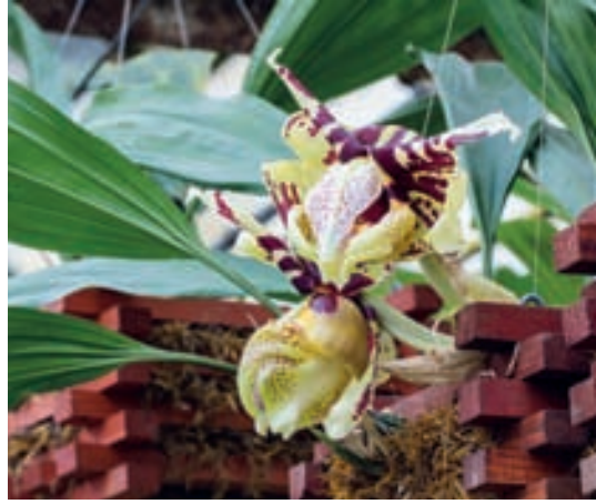
A rare and endemic species of orchid from Mexico ( Stanhopea hernandezii ) is being cultivated in the tropical greenhouse for decades

We hope to begin with the restoration of the exhibition greenhouses next year, with implementation of the H.O.R.T.U.S. project to follow.