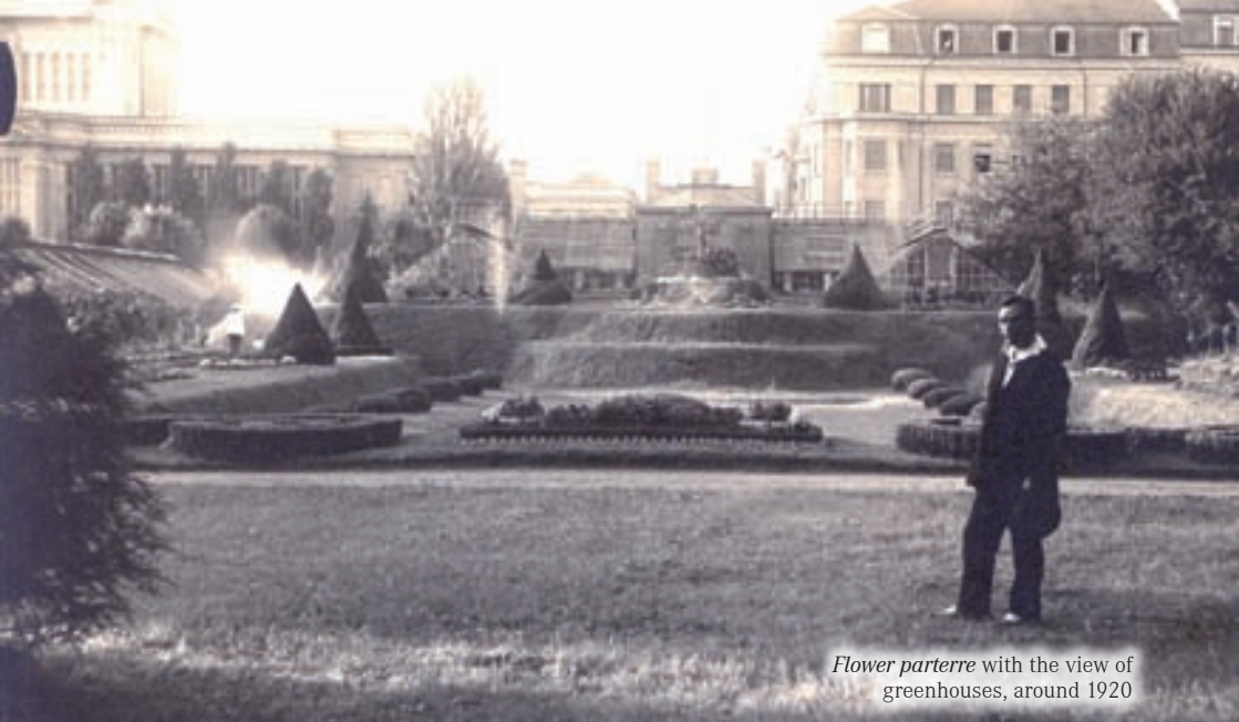
Flower parterre with the view of greenhouses, around 1920

Only a decade after its foundation, the Garden already had a diverse plant collection, which today numbers more than 5000 plant taxa. Winter resistant woody plants (shrubs and trees) are grown in the arboretum, while sensitive species from warm climates overwinter in the greenhouses.