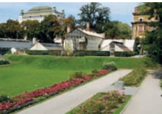
More than century old exhibition greenhouses in need of restoration, 2013