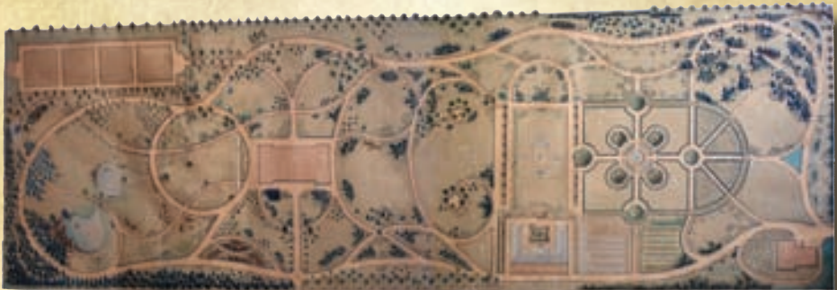
The 1889 Botanical Garden Plan

Today, the Botanical Garden is an integral part of a sequence of handsome old Zagreb squares and parks known by the name of 'Lenuci's' or the 'Green Horseshoe'. Because of its great educational, cultural, historical and touristic values and its overall significance for Zagreb and Croatia, since 1971 the Garden has been protected as a park architecture monument. It is also entered in the Register of Cultural Goods of the Ministry of Culture and protected as 'original architectural achievement and a complete urban, architectonic and park space'.