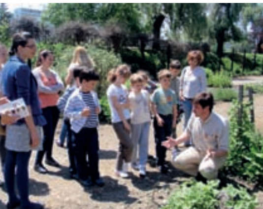
Pupils discover the Garden’s plant diversity in an expert guided tour

The activities of botanical gardens in the 21 century are largely devoted to research, conservation of wild plants and public education. Botanical gardens around the world, as well as ours, contribute to achievement of a number of adopted international conventions and agreements, with a common goal to pre-