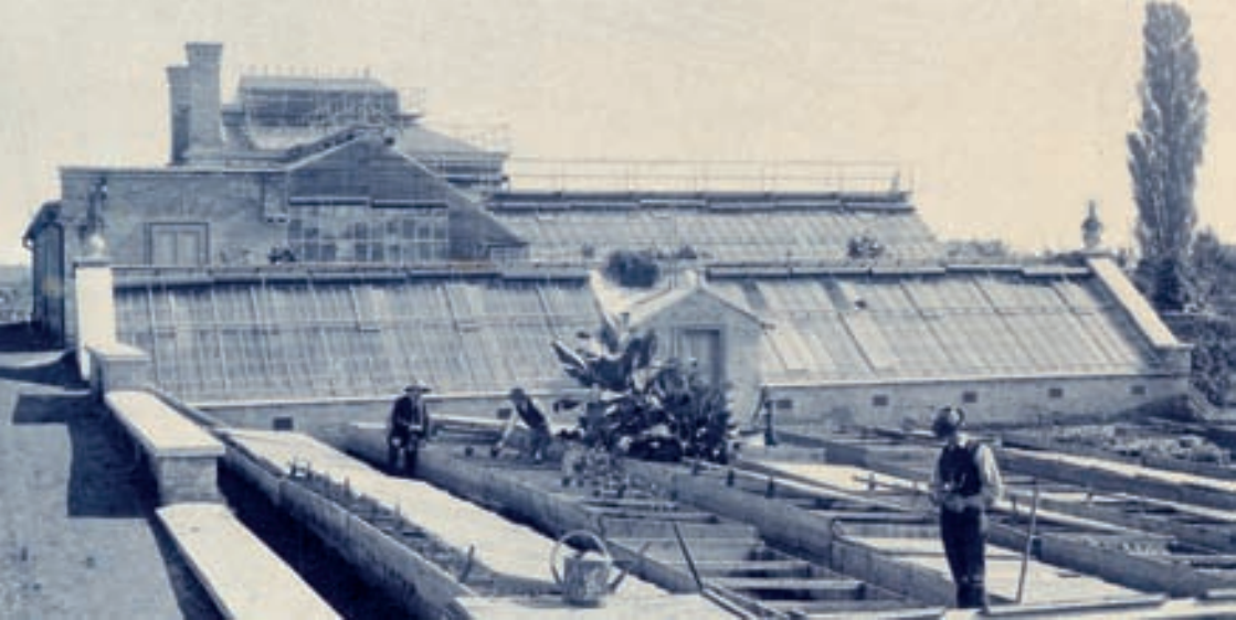
The greenhouses and propagation beds, 1895