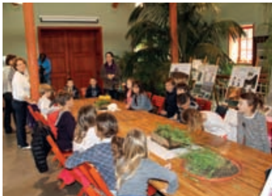
Workshop Botanical magic: let's play herbarizing! held during the 3 rd Week of Croatian Botanical Gardens and Arboreta, 2013

It is worth noting that the Garden curators, along their expert work, are engaged in scientific botanical research, with their papers published in various journals and magazines.