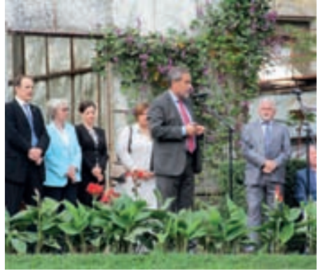
The Mayor of Zagreb Milan Bandić welcomes guests at the University garden party held to promote the exhibition greenhouses restoration project, 2013